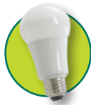
ENERGY STAR® LEDs