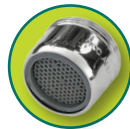
Water Faucet Aerator