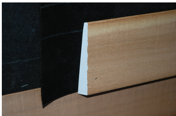
Figure 6—Completed joint. Note that fasteners are approximately one inch (25 mm) from the bottom edge of the siding and spaced well away from the end of each board. Nails were angled slightly to penetrate the furring strip and the underlying sheathing and wall stud.