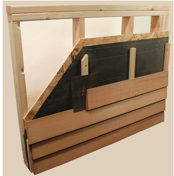
Figure 1—Demonstration of siding installation over a secondary drainage plane (rain screen) showing wall studs, sheathing, water-resistant barrier (WRB), furring strips, and interleaved WRB at the butt joint. Note that the butt joint is centered directly over the furring strip and the underlying stud and the end grain of the siding was sealed with a water-repellant preservative.

screen construction incorporates a WRB and the space between the back of the siding and the WRB serves as a capillary break ( Figure 1 ). The capillary break enhances drainage down the back of the siding or down the surface of the WRB. The airspace also tends to increase the drying rate of siding if it gets wet. Rain-screen installation of siding minimizes unequal moisture content distribution through the thickness of siding, thus minimizing warping and decreasing extractives bleed. To install siding with a rain screen, place the WRB over the sheathing, fasten furring strips through the sheathing to the underlying wall studs, and fasten siding through the furring strips to the underlying sheathing and wall studs. Structures where siding is installed directly over a WRB typically results in relatively inconsistent in-service moisture content distribution from front to back of siding, compared with installations where the siding is installed using a rain screen.