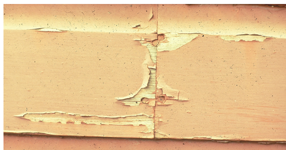
Figure 3—Water absorption into the end grain of siding caused the finish to peel. Note also that fasteners are too close to the end of the siding.

We recommend bevel cuts at the end of boards (as opposed to 90° cuts) where siding pieces are butted end-to-end ( Figure 4 ). To avoid splitting siding,